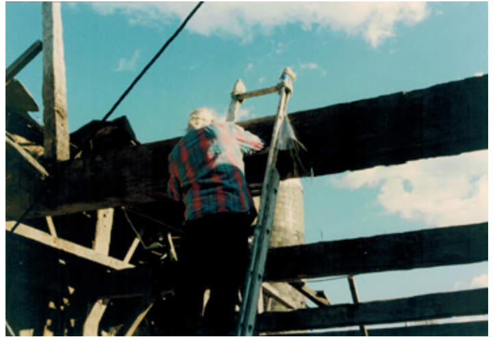
P Sinclair at Dated 1766 Barn off Route 209 in Accord Area of Ulster County, NY

Peter showed some marked interest in the converted Myers barn (one of the 18 barns mentioned above) northwest of Saugerties that had a square anchor-beam – a very rare dimension in these barns where they are always